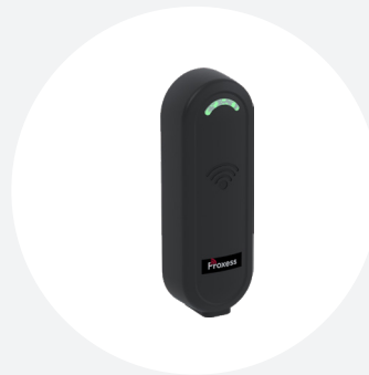
RX-MU2 RS-485 Reader

Long-range BLE mobile credentials, typically used for vehicle gate applications and for having a door unlock conveniently upon approach are also supported.