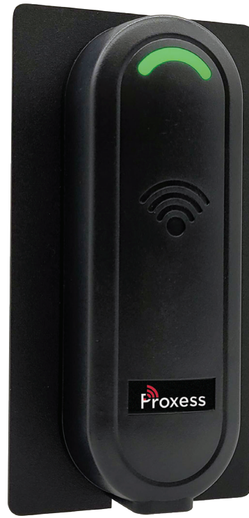
RX-MU2 shown with Single-Gang Adapter Plate