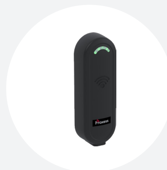
RX-MU2 RS-485 Reader

Long-range BLE mobile credentials, typically used for vehicle gate applications and for having a door unlock conveniently upon approach are also supported.