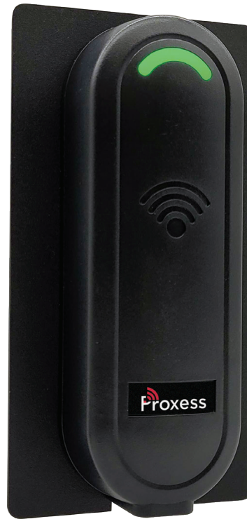
RX-MU2 shown with Single-Gang Adapter Plate